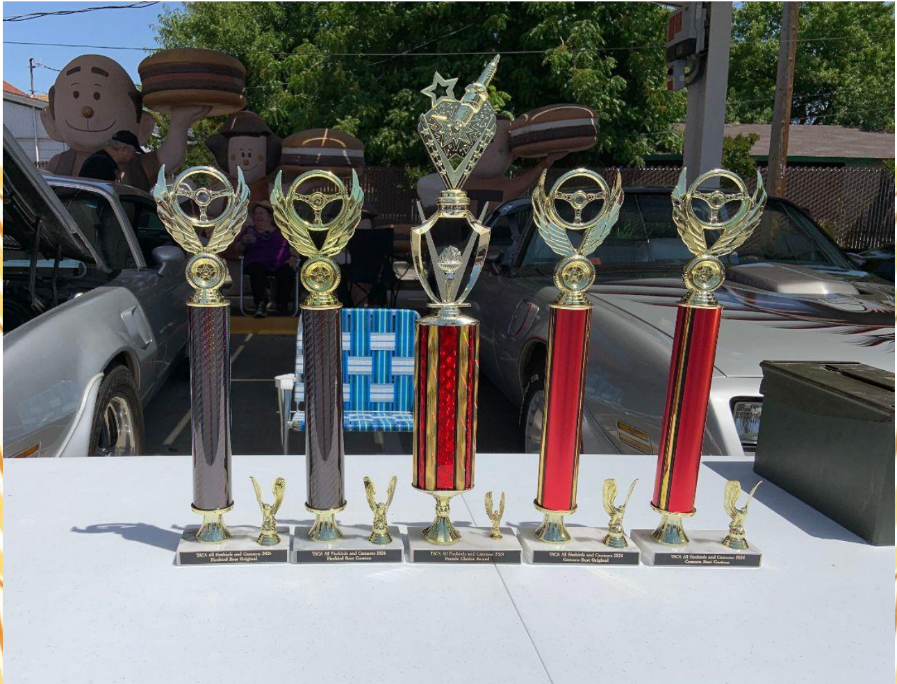
The five Trophy's, the Red ones were for Camaro's, the Center one was Peoples Choice Award, the Black Carbon Fiber ones were Firebirds.

General Motors trademarks used under license to Trevco