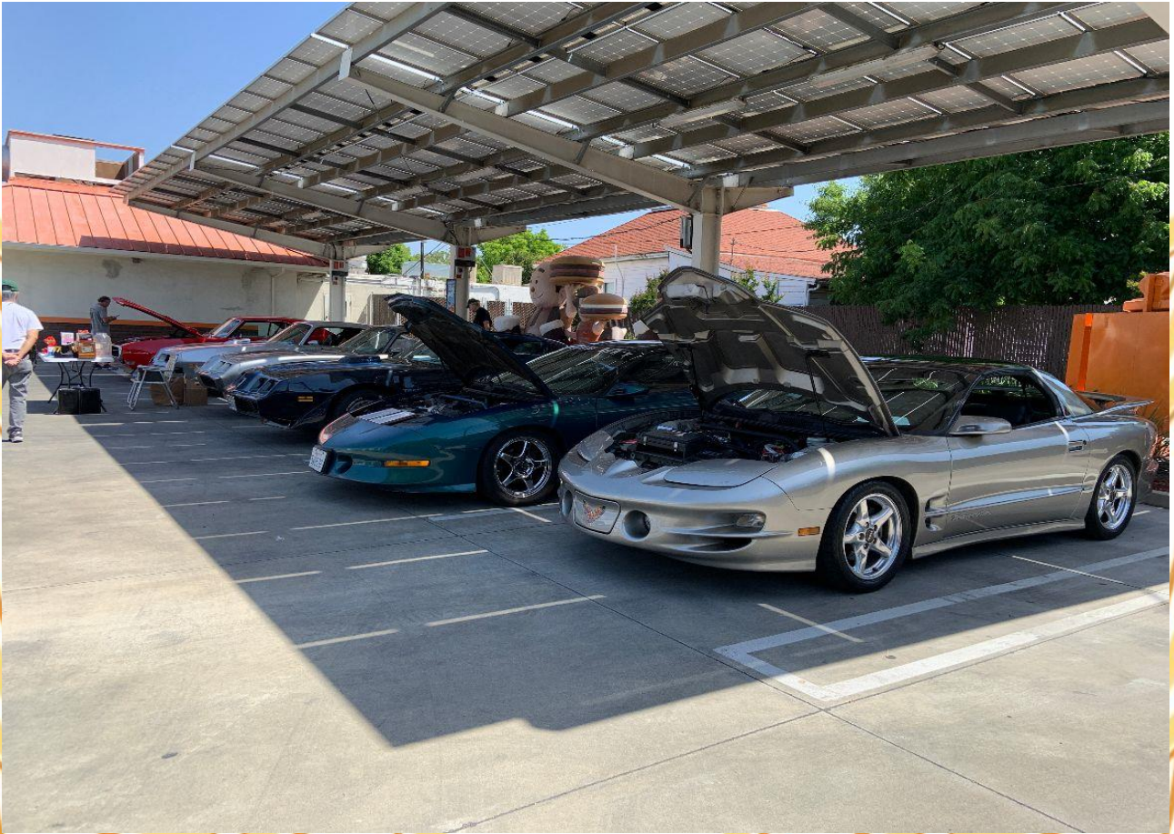
Just a few of the Trans Am that were at the All Firebirds and Camaro Car Show.

General Motors trademarks used under license to Trevco