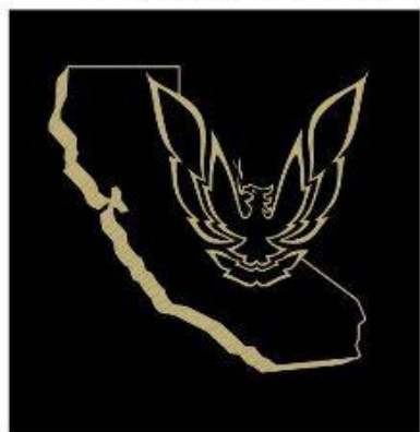
LEFT CHEST 3" WIDE VEGAS GOLD