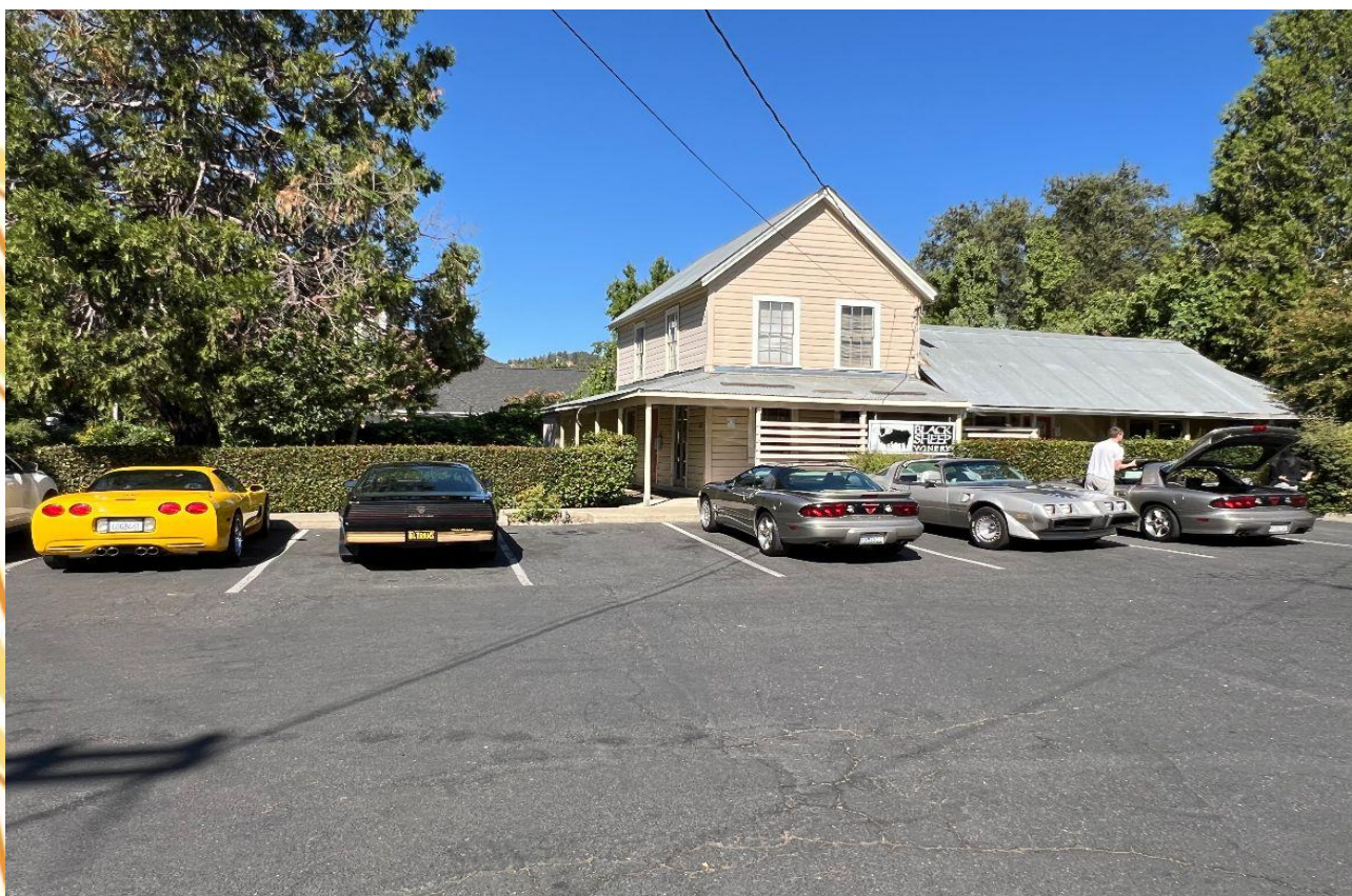
Four TA's 1984, 2001, 1979, 2000