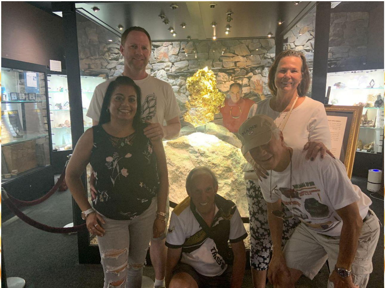
Our group picture at the Iron Stone Winery, with the 44 pound Gold specimen