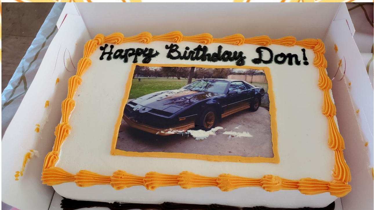
Both cakes for two events on the same day.